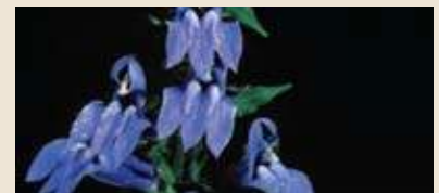
Great Blue Lobelia