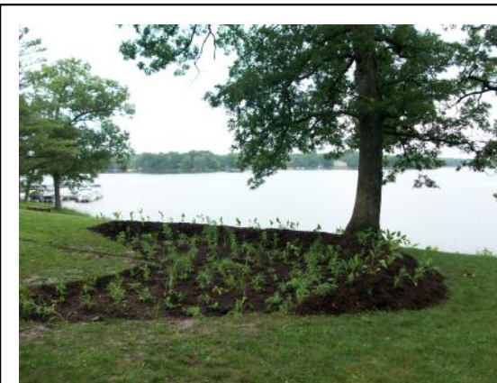
Newly installed rain garden at Davis Lodge on Lake Bloomington

Rain gardens can be 30 to 40% more efficient than regular lawns at absorption and filtration. In addition, rain gardens also help by keeping more moisture on your property, thereby decreasing the need to water your lawn and gardens. Rain gardens can also help reduce potential for home flooding and other stormwater problems on your property. Ultimately, the rainwater filtered by your rain garden may help recharge the groundwater instead of being sent elsewhere by the storm sewer system.